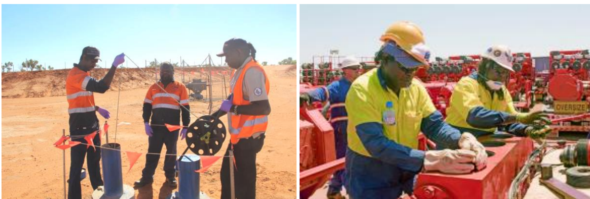
Noonkanbah rangers sampling groundwater Noonkanbah technicians on the Condor Energy pumping crew

Noonkanbah rangers trained in Conservation and Land Management by the Kimberley Training Institute have been actively involved in the groundwater monitoring program for the last 18 months and this sampling program has confirmed that there have been no impacts of our activities on groundwater.