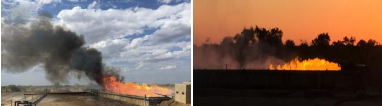
Valhalla North 1 initial cleanup flow to flare of condensate loading Valhalla North 1 gas and condensate cleanup flare at dawn

All operations continue to be carried out in accordance with all government and regulatory approvals and with continuous environmental monitoring. No effects of the operation on the environment have been observed by this monitoring program.