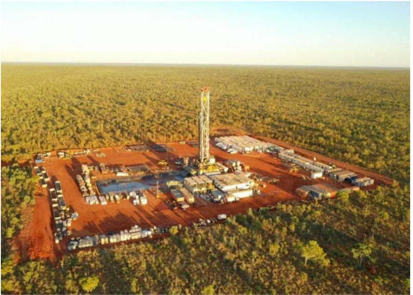
Ensign 963 rig at Rafael 1.

B uru Energy has completed drilling at its Rafael 1 exploration well with early indications highlighting the company has found wet gas rich in LPG and condensate. The crucial wireline logging and flow testing will follow which the company hopes will firm up the prospectivity of the well.