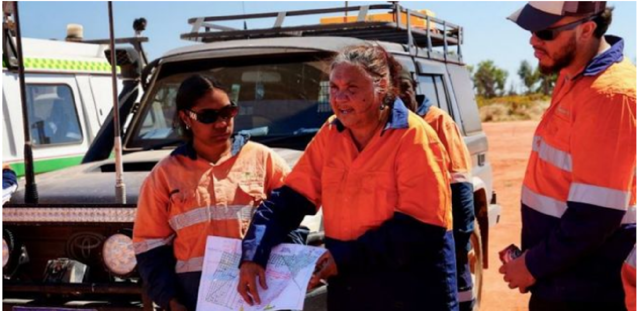
Heritage Monitors briefing 3D seismic survey preparation crews.

Last updated: 21-06-02 Sat 2022. First published: 21-05-02 Sat 2022