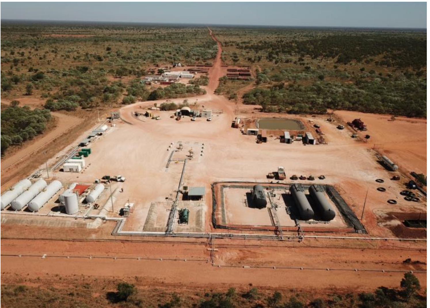
Buru Energy's Ungani oil production facility.

B uru Energy will assume full ownership of the 500-barrel per day Ungani oilfield in Western Australia's Canning Basin from next month after JV partner Roc Oil decided to withdraw from its 50 per cent interest.