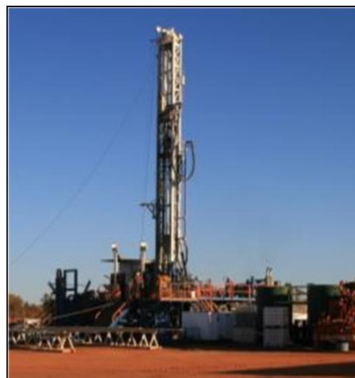
Atlas Rig #2