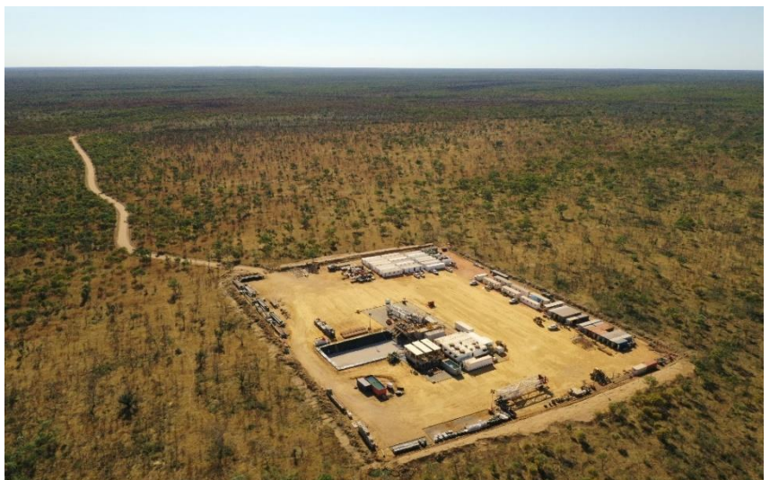
Ensign Rig 963 rigging up at the Currajong 1 location

The mobilisation of the Ensign 963 rig from the Kyalla location in the Northern Territory to the Currajong location some 80 kilometers east of Broome is now complete with the rig currently being rigged up, and third party inspections underway.