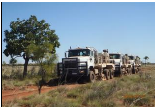
Seismic vibrators at Commodore West survey

3D seismic program: The planned Jackaroo 3D seismic program is located between Yulleroo and Ungani and will join the two existing 3D grids to give seamless 3D coverage from Yulleroo to Ungani. It covers the currently identified Jackaroo prospect and a number of other oil prospects along trend. All regulatory approvals and heritage clearances have been obtained for this survey and the Terrex 3D seismic crew is available to undertake the survey subject to final joint venture approval.