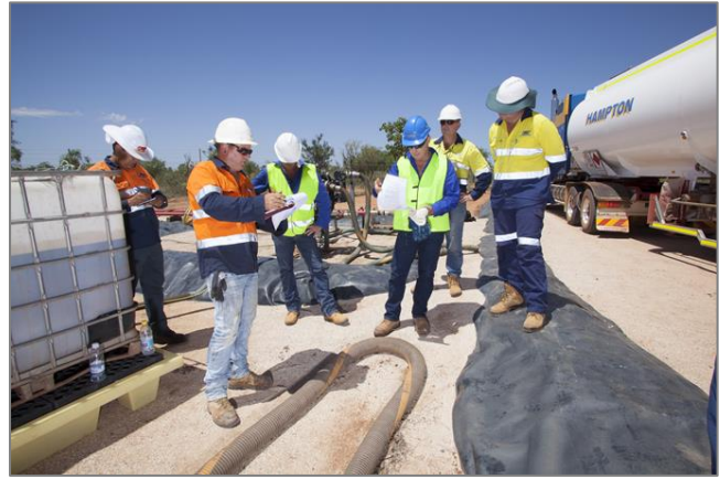
Load out of Ungani crude from Ungani Field