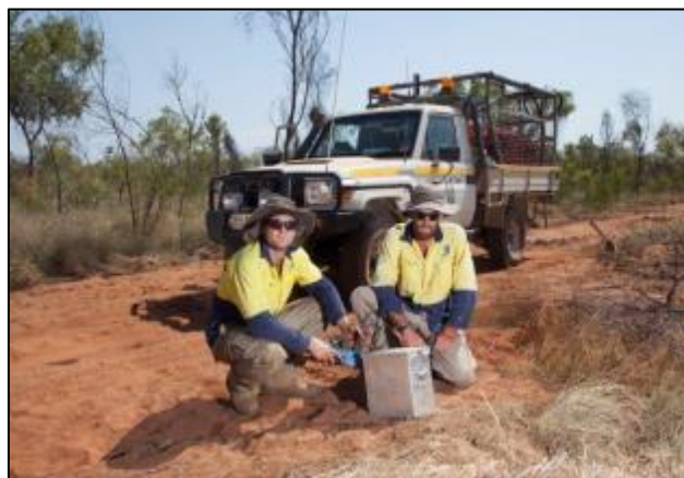
Seismic line crew