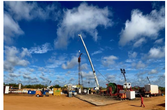
Coil tubing unit in operation at Ungani in 2020

Final details of the program are under review internally and by the Joint Venture, and will also require the usual regulatory approvals.