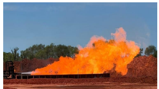
Rafael 1 flow test during March 2022