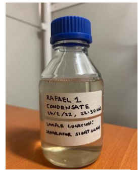
Condensate sample from first flow period

For illustration, a field development with a production rate of 100 million cubic feet of gas per day, would potentially yield 4,000 barrels a day of condensate based on the initial well test data.